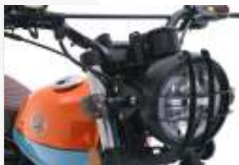
LED headlight with aluminum protection grill