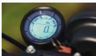
Multifunction digital counter