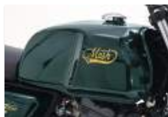
14L tank with lockable Monza cap panel