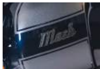
3D Mash Logo