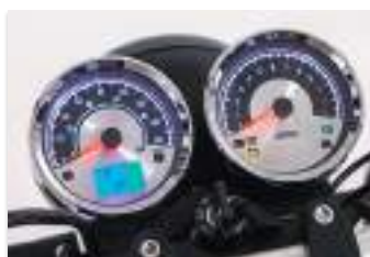
Dual counter / tachometer instrument panel