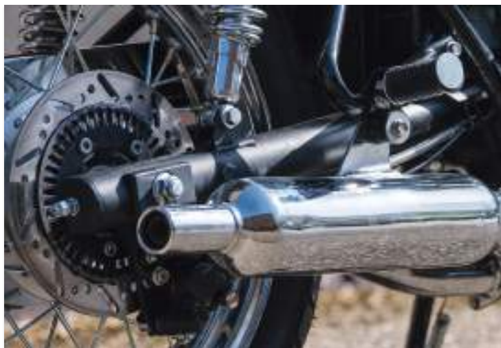
Rear disc brake, Twin chrome exhaust