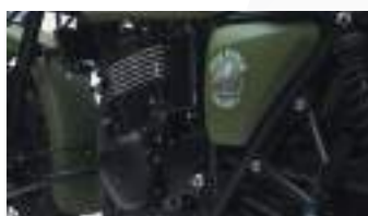
445 cc engine with reverse gear