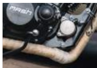
Thermal bands Wrapped Exhaust