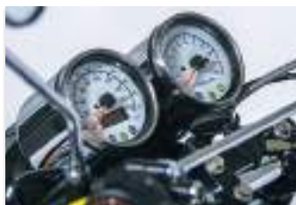
Counter and tachometer