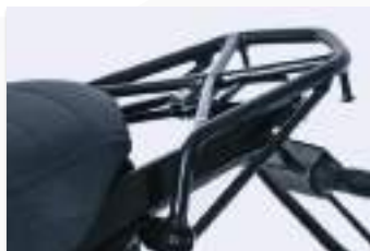
Rear luggage rack