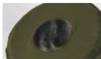
Spare wheel cover (optional)