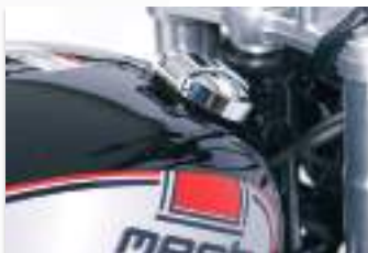
Lockable Monza fuel cap