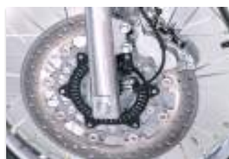
Front brake with 4 piston caliper