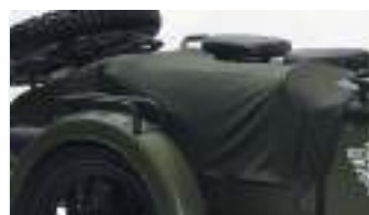
Tonneau cover (optional)