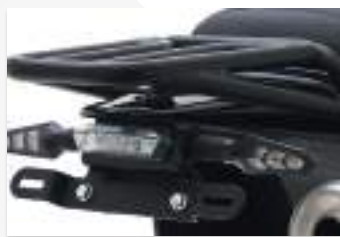
Rear luggage rack