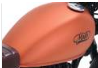
Matt copper paint