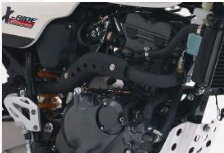
Latest generation Hyosung Euro 5 engine