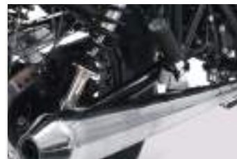
Stainless steel exhaust line