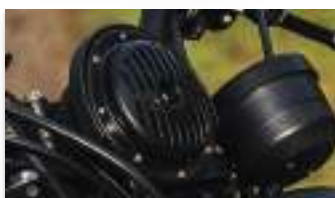
Armed horn (optional)