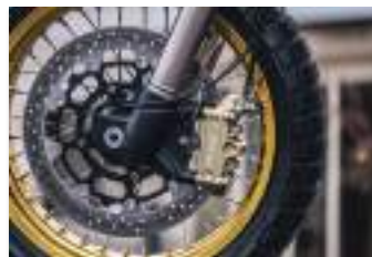
Radial caliper, anodized aluminum rims