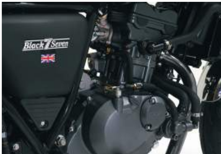
Hyosung 4T engine, twin shaft single cylinder