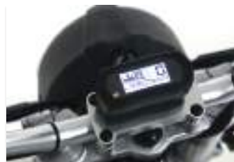
Digital counter with gear indicator engaged