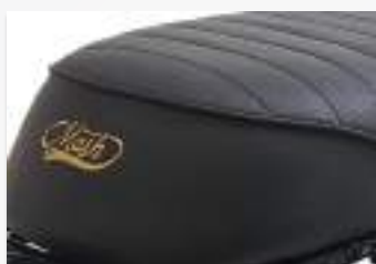
Mash comfort seat