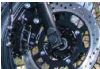
Combined braking (CBS)