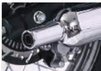
Double chrome exhaust outlet