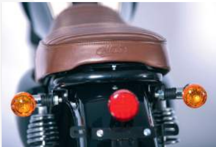
Comfort two-seater saddle