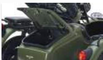
Luggage compartment lockable