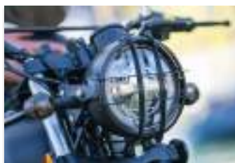
Cross handlebar and LED headlight